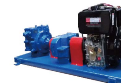
柴油机驱动 Diesel Engine Drive